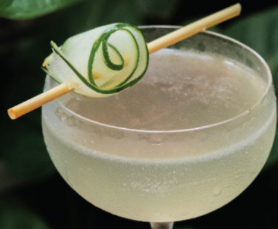
Riviera Refresher 250.- Gin, lavender, apple, cucumber and lemon