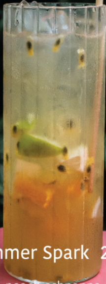
Elysian Summer Spark 250.- Ketel One vodka, peach schnapps, Regency brandy, and the lively citrus and cinnamon notes