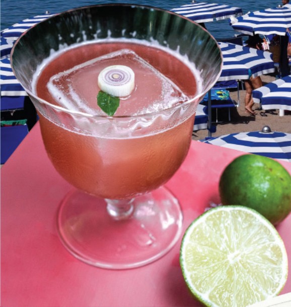
Island Fusion 125.- Roselle, Phuket pineapple, lemongrass, lime