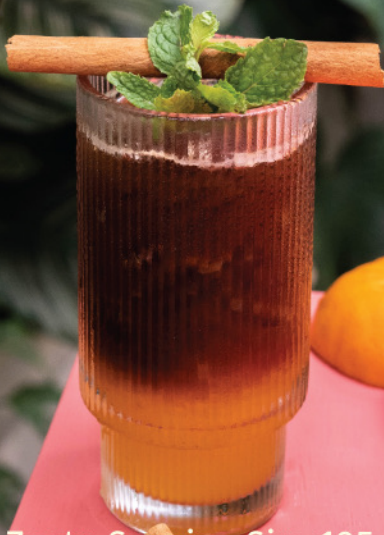
Zesty Sunrise Sip 125.- Iced Americano with freshly squeezed citrus juice and cinnamon