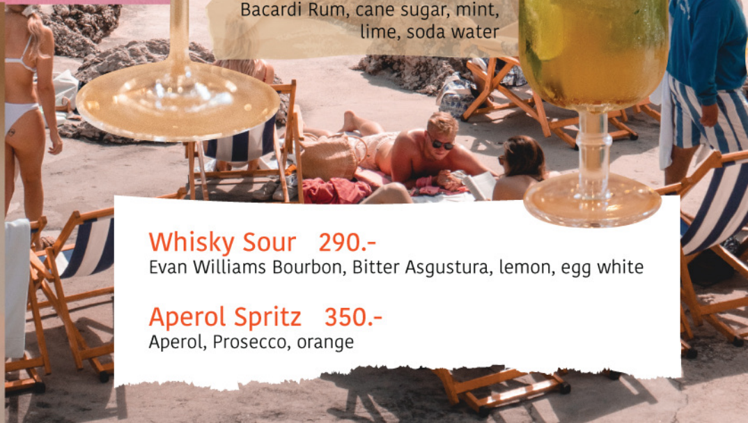
Aperol, Prosecco, orange