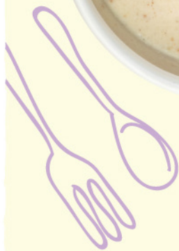
Red Mango Tango Bowl 220.-

Coconut, banana, pineapple, flax seed, chia seed, roasted coconut chips