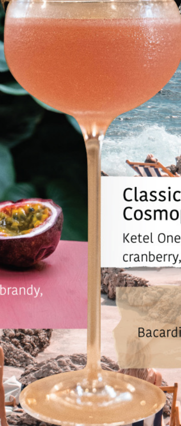
Ketel One Vodka, Cointreau, cranberry, lemon