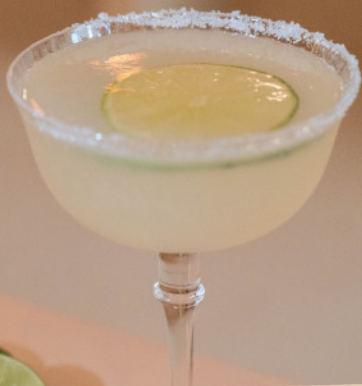
Margarita 260.- Tequila Jose Silver, Cointreau lime, salted rim