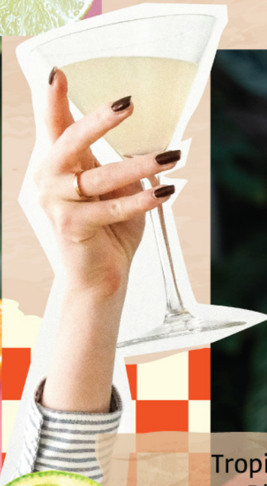
Tropical Espresso Blossom 130.- Espresso, pineapple, Elder flower