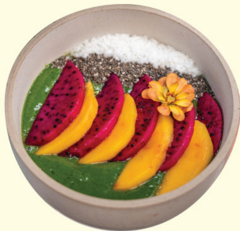
Super Green Splash Bowl (Vegan) 230.-