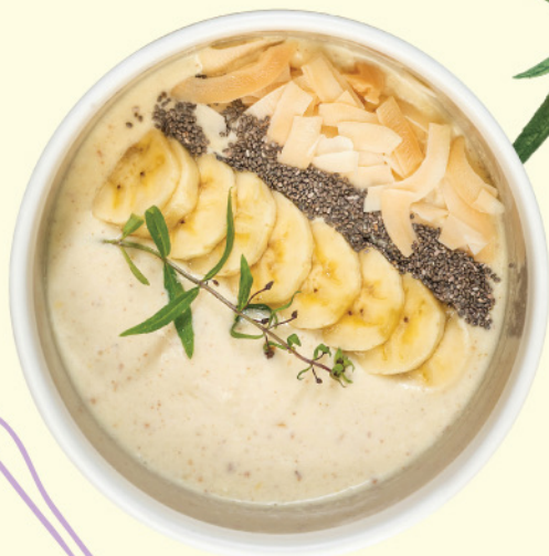
Piña Colada Paradise Bowl (Vegan) 220.-

Coconut, banana, pineapple, flax seed, chia seed, roasted coconut chips