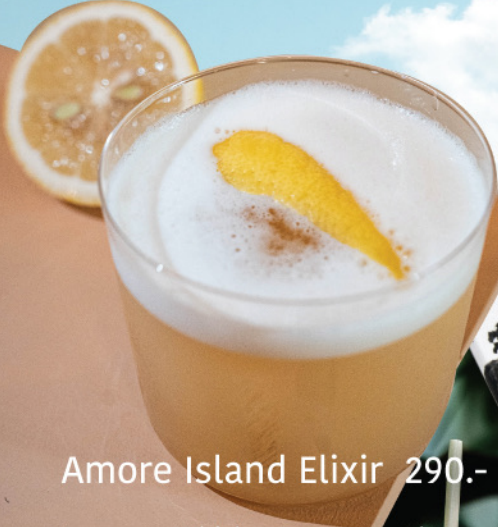
Amore Island Elixir 290.- Jameson Whisky, Asgustura Bitter, pineapple, egg white, lemon